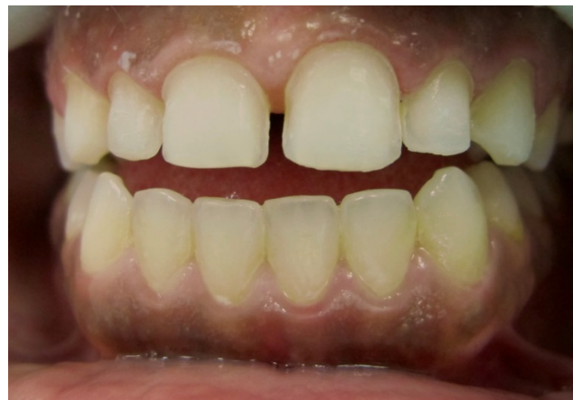
Figure 4: Anterior teeth after veneer preparation.

On a subsequent appointment 2 weeks later, six maxillary anterior teeth were prepared to receive ceramic laminate veneers. The tooth preparation was performed at an enamel depth of 0.5-0.7 mm with 1.5 mm incisal reduction using a depth cutting tapered diamond bur (diameter, 1 mm). Chamfer finish line was maintained in the cervical region (Figure 4) at the level of the gingival margin.