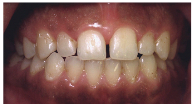
Figure 1: Preoperative view of maxillary anterior teeth in occlusion.

Oral examination revealed the presence of diastemas between the maxillary anterior teeth (Figure 1)