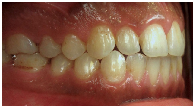
Figure 2: Preoperative view of right anterior side.

After thorough examination, complete radiographic and photographic data was collected from the patient. Impressions for diagnostic models were prepared with irreversible hydrocolloid (Heraplast, Heraeus Kulzer, USA) using type IV dental stone, and mounted on a semi-adjustable articulator. The models were studied to decide the shape and size of the restorations with the help of a diagnostic wax-up and mockup procedure.