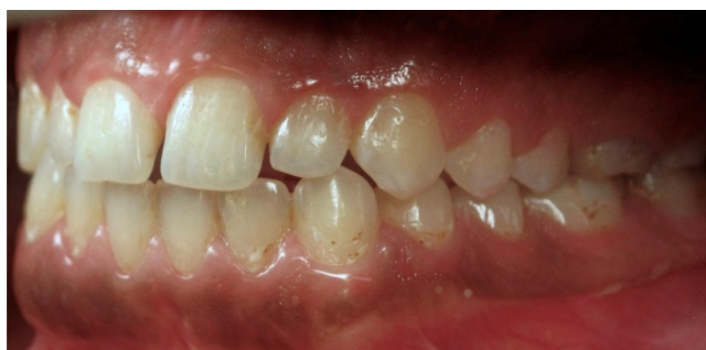
Figure 3: Preoperative view of left anterior side.

After thorough examination, complete radiographic and photographic data was collected from the patient. Impressions for diagnostic models were prepared with irreversible hydrocolloid (Heraplast, Heraeus Kulzer, USA) using type IV dental stone, and mounted on a semi-adjustable articulator. The models were studied to decide the shape and size of the restorations with the help of a diagnostic wax-up and mockup procedure.