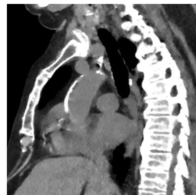
Figure 1: CAT scan without contrast showing severe calcification of ascending aorta.

in which often impaired renal function is found. An example of the findings in one of our patients is shown in Figure 1. All patients for minimal invasive mitral valve surgery, re-do procedures and minimal access aortic valve surgery had a CAT scan with contrast. We evaluated the effect of the implementation of preoperative Chest CAT scanning on operative strategy and the incidence of stroke. If the CAT scan showed