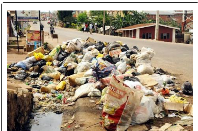
Figure 1: Solid Waste disposed on the streets.

to the amount of waste generated [8]. These waste generated as a result of increased consumption of resources can be very harmful to human and environmental health [9].