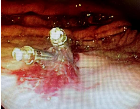
Figure 2: Another endoscopic clip was positioned.

cessation of bleeding, which returned after the endoscopic clip was placed. Hemostasis was repeated with adrenaline, this time with interruption of bleeding, and another endoscopic clip was positioned, with resolution of the frame (Figure 2). Recovery of hemodynamic status after endoscopy, suspension of noradrenaline and stabilization of hematimetry. The patient was extubated the next day, maintaining adequate respiratory pattern. Another endoscopy did not reveal residual bleeding. ICU discharge occurred on 18th day of hospitalization.