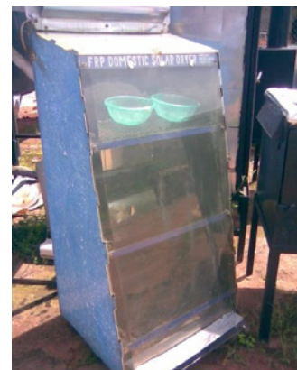
Figure 1c: Sun-tracking solar dryer.

of the process excluding night periods ranged between 27.1–35.5°C (ambient), 29.8–54.8°C (Latitudinal box dryer), 28.6–50.8°C (Greenhouse dryer), and 27.5–62.0°C (Sun-tracking dryer) with ambient temperature having the least values for all readings as shown in Figure 2a. The maximum relative humidity recorded were 85.0% (ambient), 74.5% (Latitudinal box dryer), 78.0% (Greenhouse dryer), and 73.0% (Sun-tracking dryer) with ambient relative humidity having the highest values for all readings as shown in Figure 2b.