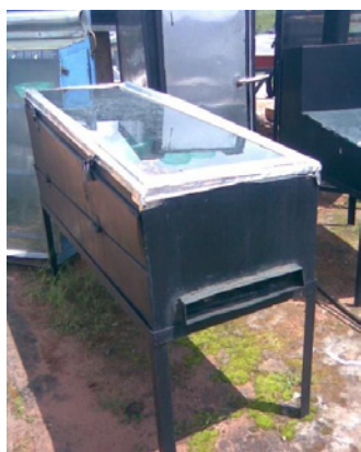
Figure 1a: Latitudinal box solar dryer.

The ambient and chamber temperatures throughout the duration