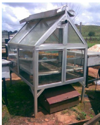
Figure 1b: Green house solar dryer.