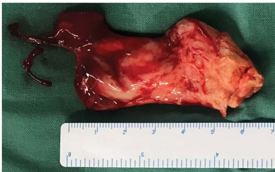
Figure 1: Thromboembolic material retrieved from the para-visceral aorta in a 45 year-old male who developed acute kidney, spinal cord and lower limb ischemia after partial pneumectomy for metastatic sarcoma. The embolic tumor was far too large to be retrieved endovascularly.

There are endovascular techniques available for retrieval of thromboembolic material in the arterial system. Notable modalities include aspiration thrombectomy and clot retrieval devices. These methods were developed to improve outcomes for patients with acute ischemic stroke. In the early twenty-first century, the only treatment available to these patients was systemic thrombolysis. However, this therapy was limited by a 3-hour treatment window and poor recanalization rates of large vessel occlusion. Chemical thrombolysis was not effective in patients with a larger volume of thrombus, particularly firm cardiac thrombus. Thus, endovascular techniques to physically retrieve rather than chemical degrade thrombus were developed. Endovascular mechanical thrombectomy dramatically improved recanalization rates and decreased