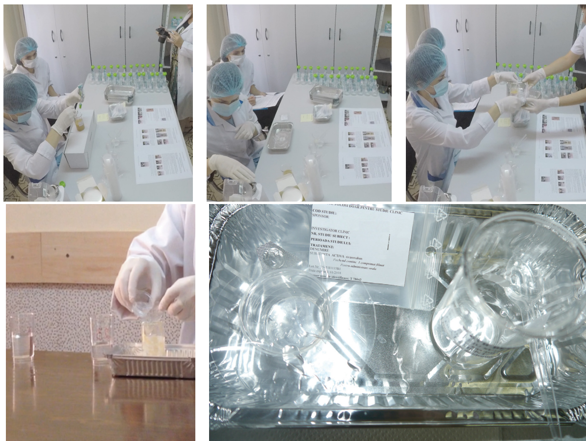
Figure 1: Representative snapshots of the preparation and rinsing processes