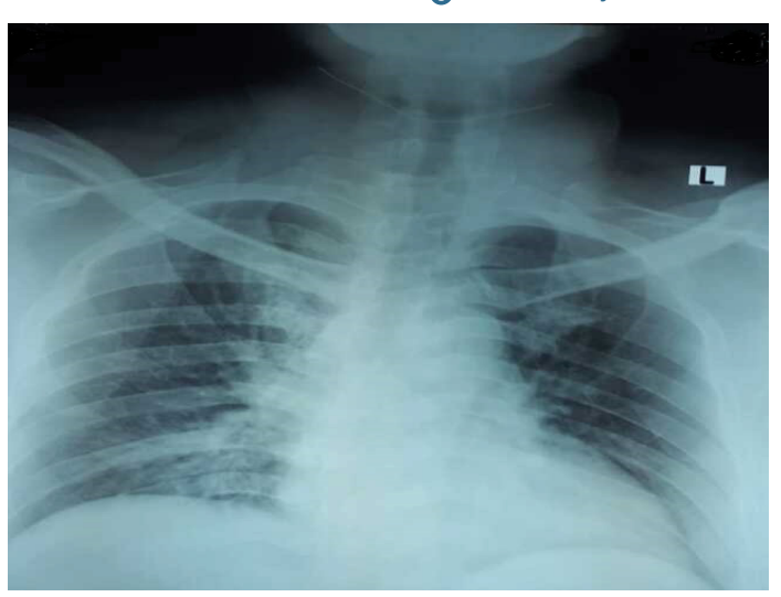
Figure 2: CXR-normal findings.

There is conflicting evidence of COVID-19 severity in SCD. In the