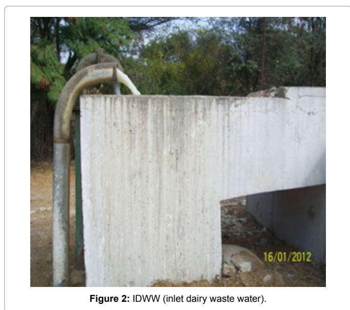
Figure 2: IDWW (inlet dairy waste water).