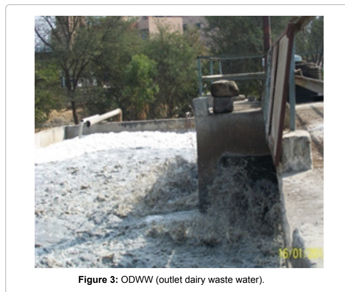
Figure 3: ODWW (outlet dairy waste water).