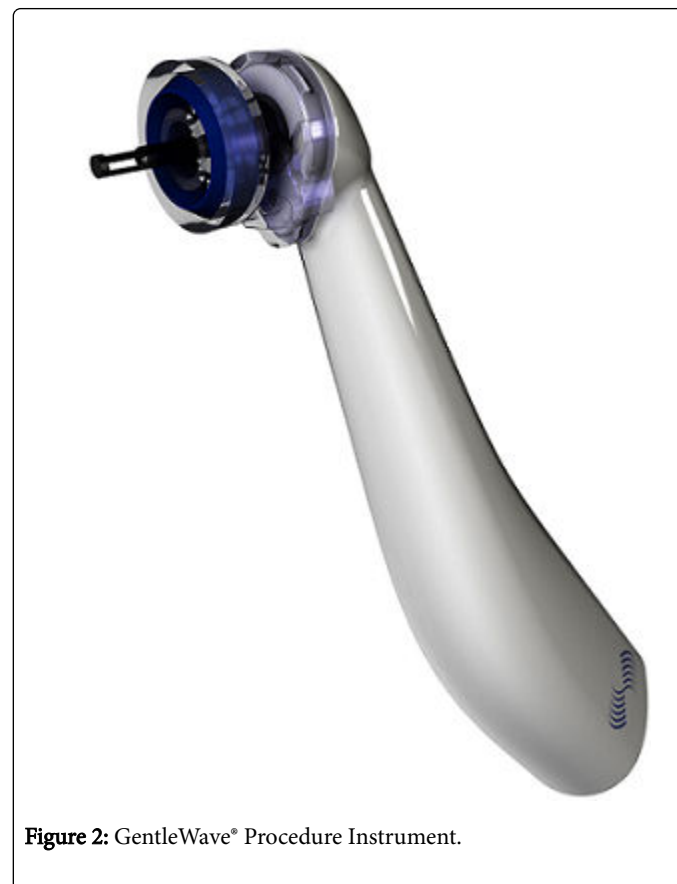
Figure 2: GentleWave® Procedure Instrument.

tissue and periradicular testing. The patient reported no pain or discomfort related to the subject tooth since the GentleWave Procedure. Radiographic examination was not completed at this time.