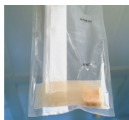
Figure 3: Type bags Stomacher.

The medium is inoculated with a dilution of the sample to be tested and it is transferred by filling tempo instrument in the tempo card. The medium is homogeneously dispersed in 48 well plates in three different volumes. The card is then hermetically sealed to avoid any risk of contamination during handling. Subsequently occurs the reading, interpretation and validation of results in a single transfer step.