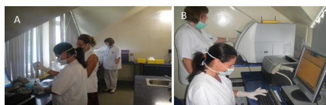
Figure 1: A. TEMPO-station preparation B. Reading station.

Fully automatic method, which allows the quantitative determination of bacterial germs, based on the traditional microbiology method, namely the multiple tube method. It shows sensitivity and ease of use, allows quick results to the classic method of working (3-7 d) and saving time in preparing culture media, glassware preparing for sterilization, packaging, inoculation, reading plates, autoclaving and washing glassware (Figures 1 A and B).