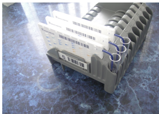
Figure 2: Card with a transfer tube and a vial.

The TEMPO test is composed of a card with a transfer tube and a vial with a specific culture medium. The culture media is dehydrated, sterile, ready-to-use, disposable, selective TC (Total Coliforms), EC ( E. coli ), EB (Enterobacteriaceae), STA ( Staphylococcus coagulase+ ) LAB (Lactic acid bacteria) or -TVC non-selective (Total Number of Germs), Y+M (Yeasts and Moulds), as identified by the bar code and the colour code (Figure 2) and TEMPO Stomacher bags (Figure 3).