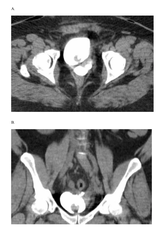
Figure 1: CT urography images of a vesicovaginal fistula in Patient 1. A axial delayed-phase contrast enhanced image. B - coronal delayedphase contrast- enhanced image.

MatriStem is a commercially available porcine-derived a cellular UBM that is manufactured either in sheets or in the form of micronized