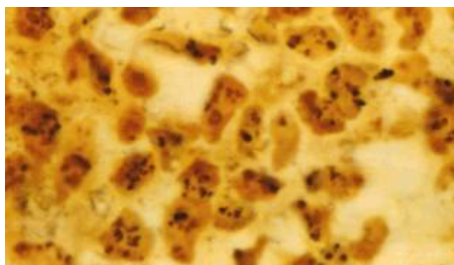
Figure 1: Case of Adenocarcinoma of gallbladder showing AgNOR dots in cluster form (AgNOR stain X 1000).

AgNOR counting and interpretation: AgNORs appear as brown