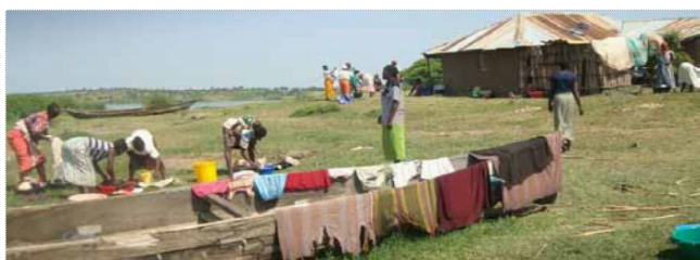
Plate 1: A fishing community on the shores of L. Victoria.

Historically, there has been a high prevalence of intestinal parasite infections (IPIs) among human populations in sub-Saharan Africa and particularly in western Kenya, (Plate 1) [1]. Today, IPIs are still common in economically undeveloped rural areas in sub-Saharan Africa. A more recent survey around Kisumu city in close proximity to the study area indicated that 34% of sampled children were infected with one or more helminth species, whereas 16.2% of children were infected with one or more Soil Transmitted Helminths (STH) species. Schools in closest proximity to Lake Victoria and River Nyamasaria had the highest S. mansoni prevalence while schools with STH were more homogeneously distributed. Mean school prevalence of S. mansoni infection was 21% while up to 20% had S. hematobium , hookworms, trichuriasis or ascariasis [1].