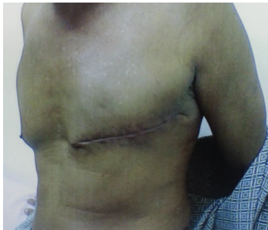
Figure 4: Post operative left mastectomy scar.

and does not contain lobules [6]. Most cases of male breast carcinoma are oestrogen-receptor and progesterone-receptor positive compared to women [2,4,6,7]. As in this case, both oestrogen and progesterone receptor are detected within the tumour.