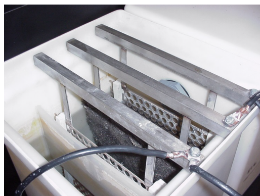
Figure 2: Electro winning test cell.

Foaming reagent concentration tests: These tests were performed