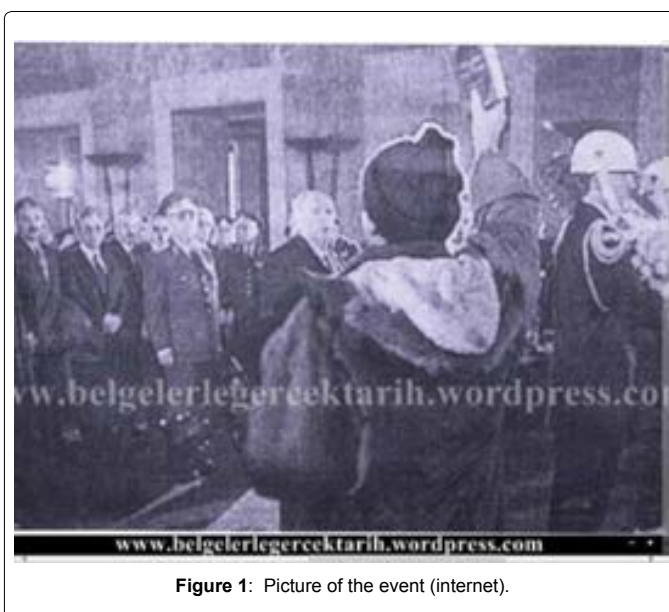
Figure 1: Picture of the event (internet).

He does not even attempt to hide the “crime”. Cross-examination soon illuminates surprising findings. The man does not want this nice little girl to grow up and get involved in sensuous vice, thereby becoming a wicked woman. He prefers to send this innocent soul to the Paradise with a guaranteed shortcut. The inquisitors ask: