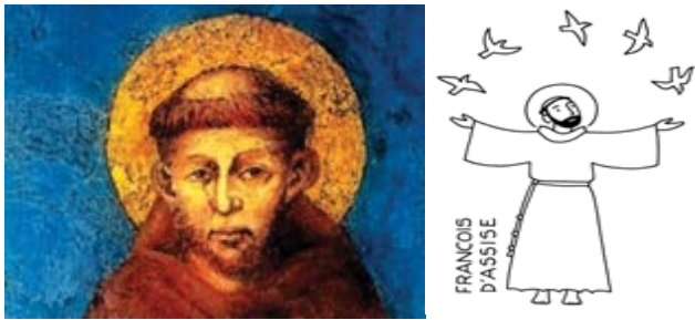
Figure 6: Representations of Saint Francis (internet).