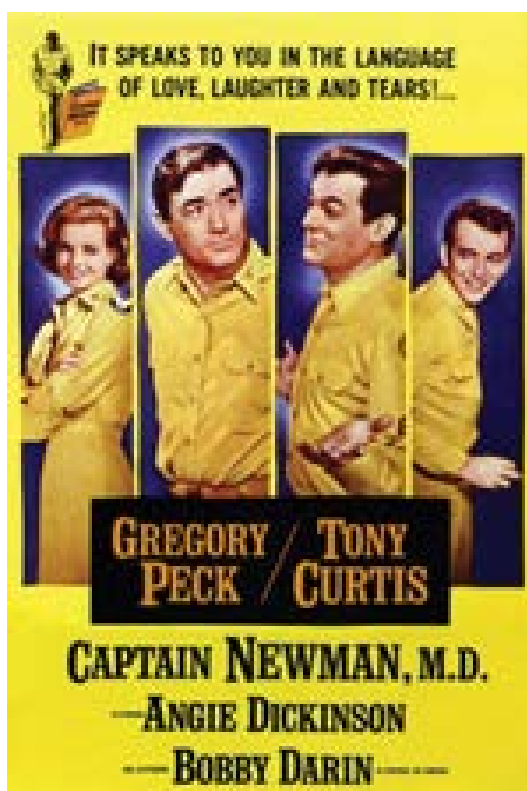
Figure 7: Poster of the mentioned psychological movie (internet).