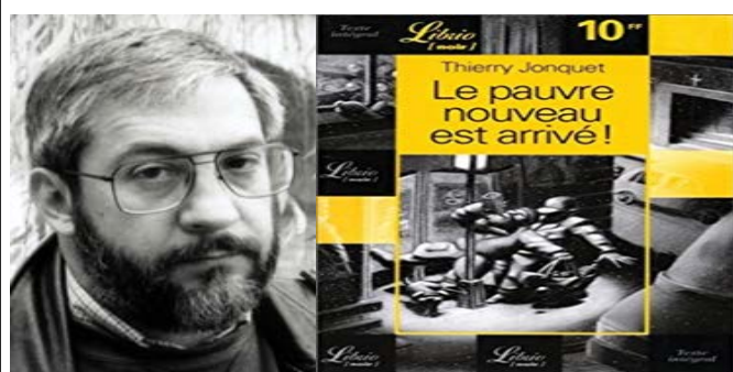
Figure 5: French author Thierry Jonquet (1954-2009) and his book (internet).

with the same theme of psychiatry, if only as one of the rich number of subthemes [6] taken in the book: