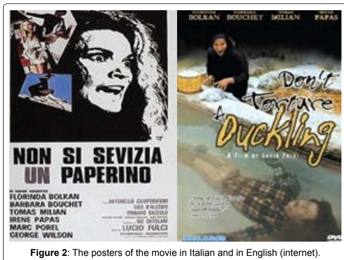
Figure 2: The posters of the movie in Italian and in English (internet).

A reporter (Martelli) and a promiscuous young woman Patrizia (Barbara Bouchet) (who seems misplaced there but feels obliged to hide herself from urban regions for a time, following a drug scandal) try to solve a series of child killings in a remote superstitious southern Italian town.