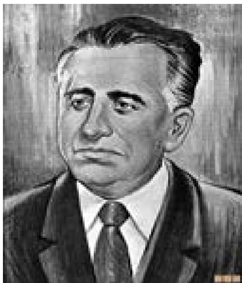
Figure 4: M.D. Mazhar Osman Usman.