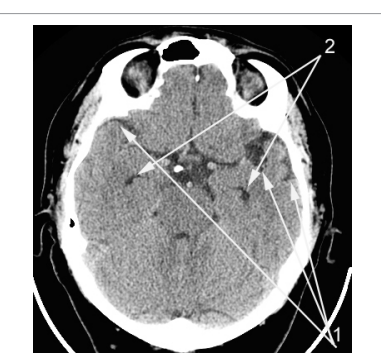
Figure 2: Patient S, female, 52-year-old: CT of the brain. Early stage TDR-1 (tissue mass decrease: right temporal lobe-9%, left temporal lobe-14%) 1) Marginal atrophy 2) Atrophy in the form of a cavity.