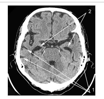
Figure 4: Patient P, female, 72-year-old: CT of the brain. Late stage TDR-3 (tissue mass decrease: right temporal lobe-42%, left temporal lobe-38%). 1) Marginal atrophy 2) Atrophy in the form of a cavity.

Figure 3: Patient K, male, 58-year-old: CT of the brain. Middle stage TDR-2 (tissue mass decrease: right temporal lobe-27%, left temporal lobe-20%) 1) Marginal atrophy 2) Atrophy in the form of a cavity.