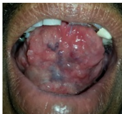
Figure 2: Shows diffuse firm swelling of the ventrum of the tongue with telangiectatic pebbly surface.