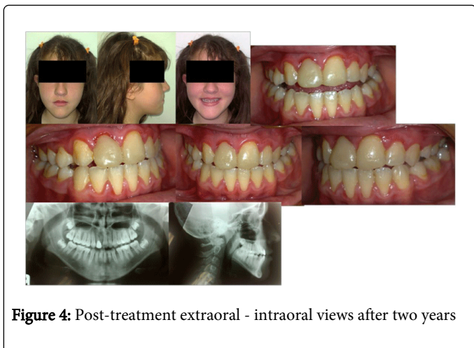
Figure 4: Post-treatment extraoral - intraoral views after two years

Post-treatment extraoral photographs show a general improvement in the facial profile. Facial aesthetics were improved by reducing the prominence of the lower lip. Maxillary incisor proclination resulted in protrusion of the upper lip. Post-treatment intraoral photographs show satisfactory dental alignment and acceptable overjet and overbite. The patient was satisfied with her teeth and profile. Good intercuspation, interproximal contacts and satisfactory root parallelism were achieved (Figure 4).