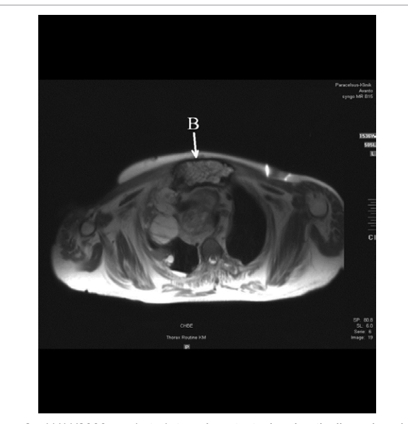
Figure 2: 11/11/2009 pre(retro)sternal metastasis, drastically reduced after therapy, encompassing 196308 mm<sup>3</sup>.