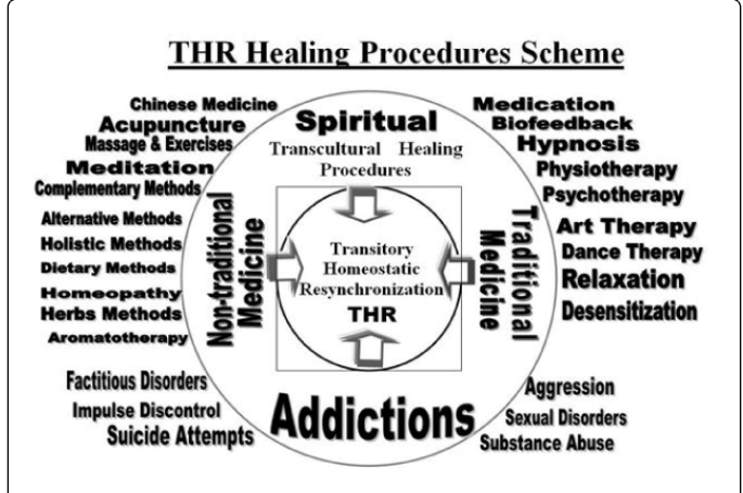
Figure 2: Western and Eastern methods to sustain Transitory Homeostatic Resynchronization (THR) Remission.

This places nurture at a pivotal point by employing physiological knowledge to reverse disharmony into homeostatic functions under favorable external conditions.