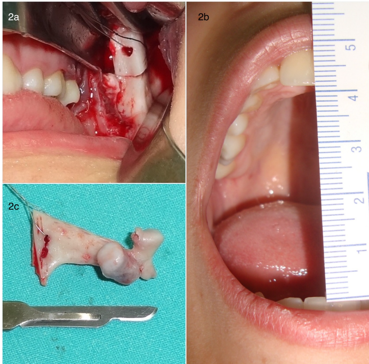
Figure 2: a) Intra-oral osteotomy of the coronoid process. b) Surgical specimen. Coronoid process with the tumor. c) Maximum interincisal mouth opening 1 year post-surgery.