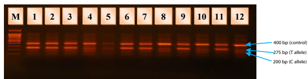
Figure 3a: Ethidium bromide stained agarose gel electrophoresis of SNP rs12979860 amplification by PCR, M: 100 bp DNA ladder, lane 1, 2, 3, 5, 6, 7, 9 and 11 the electrophoresis pattern of genotypes TT, Lanes 4, 8, 10 and 12 genotypes CT.