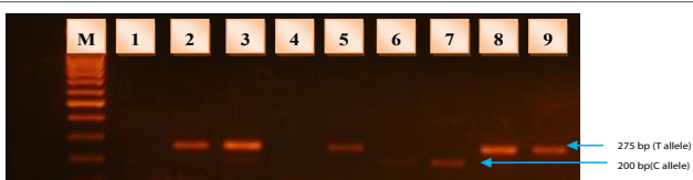
Figure 3b: PCR analysis of IL28B SNP rs12979860 (without control primers) and the products of PCR were separated by 2% agarose gel electrophoresis and stained with ethidium bromide (0.5 mg/L). M: 100 bp DNA ladder, lane 1 and 4: negative control, lanes 2, 3, 5, 8, and 9 the electrophoresis pattern of genotypes TT, Lanes 6 and 7 genotypes CC.