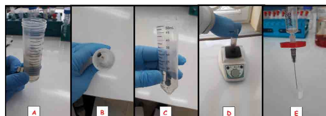
Figure 2: Main steps of MSPE.

Solid phase extraction (SPE) methods are mainly preferred in sample preparation owing to useful and practical properties. Use of magnetic solids in SPE methods provided important advantages to overcome these complications. Their magnetic properties help easy separation using a magnet, after accumulation of target molecules on particles. Experimental steps of magnetic solid phase extraction (MSPE) was given in Figure 2. In an application, synthetic drug active ingredients are also followed by international authorized organizations. Imitation or fake products are sold in everywhere. So, determination of drug molecules at trace levels is a challenge for analytical chemists. A sensitive analytical methodology was investigated to concentrate and determine of sildenafil citrate (SLC) present at trace level in herbal supplementary products [4]. The proposed method is based on simple and sensitive pre-concentration of SLC by using magnetic solid phase extraction with new developed magnetic nanodiamond/graphene oxide hybrid ( \text{Fe}_3\text{O}_4\text{@ND@GO} ) material as a sorbent. Experimental variables affecting the extraction efficiency of SLC like; pH, sample