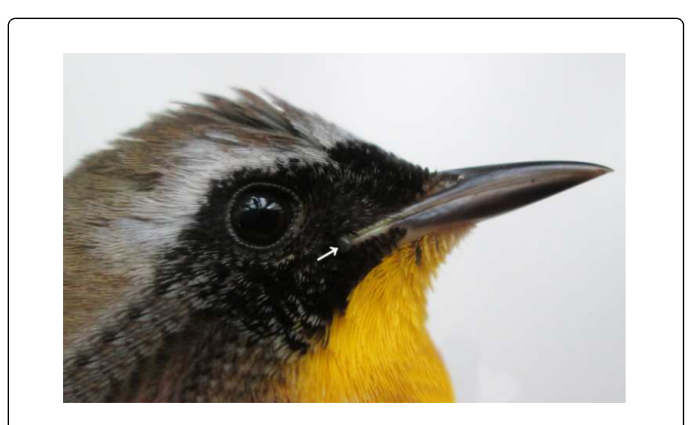
Figure 2: Common Yellowthroat, male, parasitized by a partially engorged Ixodes sp. nymph. Arrow points to engorged nymph.

At Ste-Anne-de-Belleville, Québec, a partially engorged I. affinis nymph (15-5A51) was collected from a Common Yellowthroat, Geothylypis trichas (Linnaeus), a southern temperate songbird, on 26 May 2015 (Figure 2). The nymph tested positive for B. burgdorferi s.l. and, based on DNA sequencing, was validated as B. burgdorferi s.s. The discovery of I. affinis nymphs in Québec constitutes a new extralimital distribution record for this tick species. As well, it is the first account of I. affinis on birds in Québec and, notably, the first report of a B. burgdorferi s.l.-infected I. affinis in Canada.