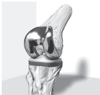
Figure 3: Total condylar.