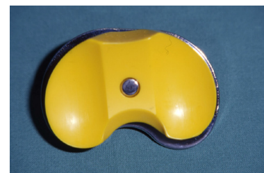
Figure 7: R type.

In 1992 J Insall, P Aglietti and P Walker developed the Medially Biased Kinematics Knee (MBK-Zimmer) (Figure 9). The design