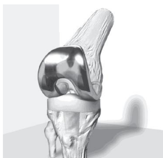
Figure 2: Duopatellar.

However during the early period of its clinical use two concerns were highlighted.