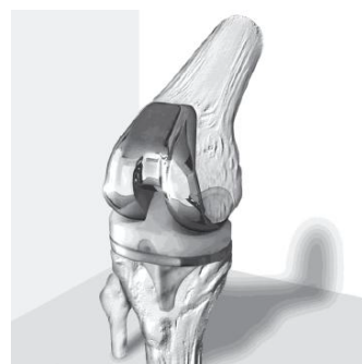
Figure 6: Optetrak.