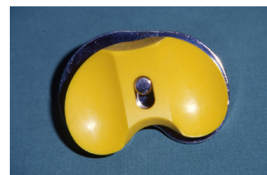
Figure 8: RS type.