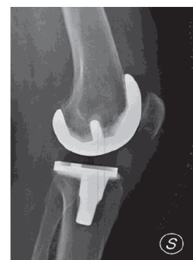
Figure 9: Multigen Plus total knee system (Lima-Lto).