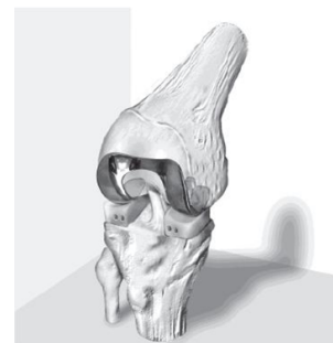
Figure 1: Duocondylar.

This approach involved the implant that preserved most or all of the soft tissues of the knee joint, especially one or both cruciate ligaments. Yamamoto, in 1970 [6], at the Okayama University Medical School in Japan, was the first to make use of an anatomical femoral component with a minimally constrained single-piece polyethylene tibial component. The original model called the Kodama-Yamamoto knee, was made of COP alloy (Co, Cr, Ni, Mo, C, and P) and consisted of an anatomical femoral mold component. This implant included an