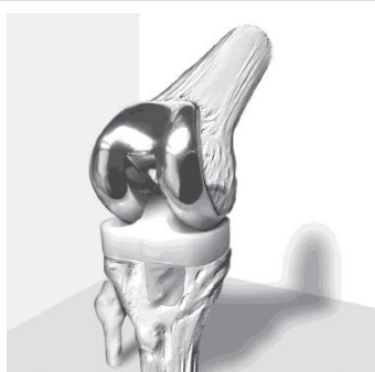
Figure 4: IB-I allpoly (courtesy of Prof. F. Catani).

First, the femoral component would shift forward, especially in flexion; in some cases this would even result in knee dislocation or belatedly in the loosening of the tibial component.