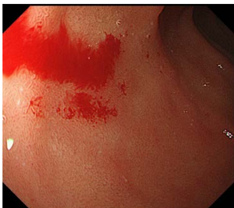
Figure 1C: Bleeding Type 1b duodenal angioectasia.

of Helsinki. Written informed consent was obtained from all patients prior to the procedures. The study was approved by the ethical committee of Sapporo Kosei Hospital.