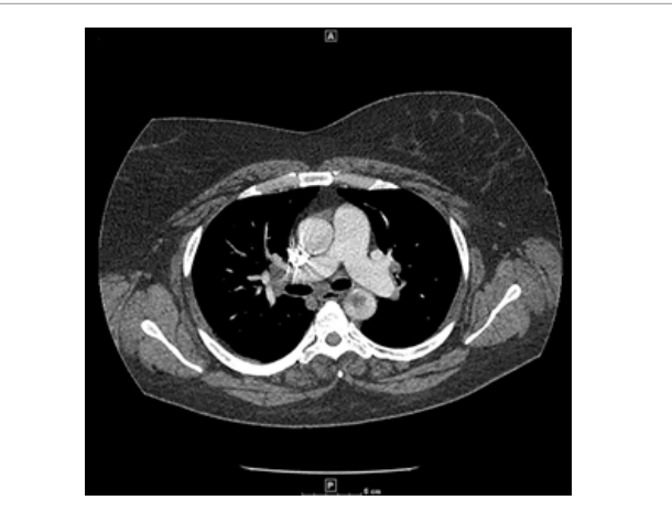
Figure 1: CT-Angiography axial image demonstrating thrombus in a non-aneurysmal thoracic aorta.

Physical exam revealed a cold left foot and ankle with loss of pinprick sensation. Dorsal is pedis and posterior tibial pulses were absent on the left. A Doppler signal was obtained in the left popliteal artery. The right lower extremity vascular exam was unremarkable. A CT-