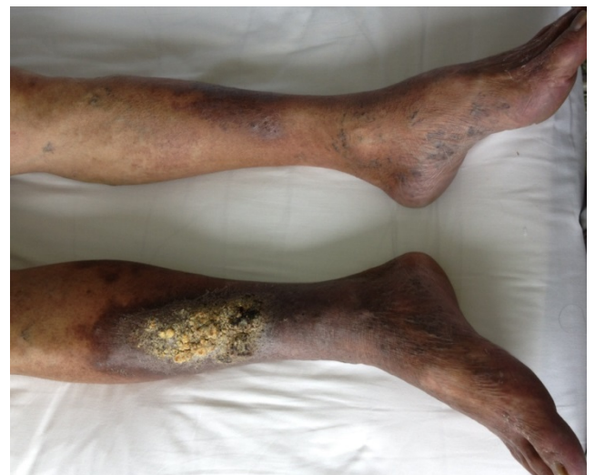
Figure 1: Pigmentation on both lower limbs