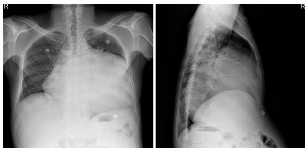
Figure 2: Evidence of congenital heart valve disease