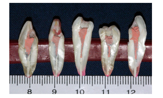
Figure 2: Photograph used in the Image Tool 3.0 software for analyzing the displacement of the apical plugs.