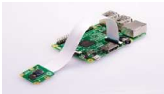
Figure 2: Camera for Image processing.