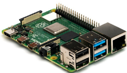
Figure 3: Raspberry Pi.