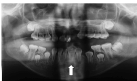
Figure 2: Double tooth involving the permanent mandibular left central and lateral incisors.