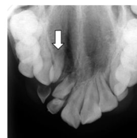
Figure 4: A conical shaped supernumerary tooth in relation to permanent maxillary right canine.

[2,10] whereas others concentrated on only one or two specific types of dental anomalies such as tooth number, size, shape, time of formation or eruption [3,8,9,12]. Moreover, some authors reported only dental anomalies that occurred in the anterior maxilla [19,45] or on specific teeth [9,18,28,45,61-65]. Therefore, the figures from the present study are best compared with the published results for individual anomaly. Various factors such as the different characteristics of the samples in terms of size, age range, source of the sample, and the methodology may also influence the comparability of the results between this and other studies.