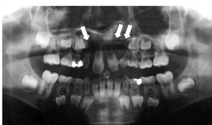
Figure 1: Missing permanent maxillary lateral incisor and canines.