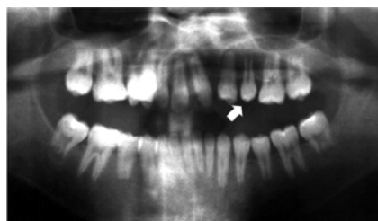
Figure 6: Microdontic maxillary left second premolar.

of missing teeth (37.5%) was higher than the 4.5% for Danish and Norwegian children [14], the 5.2% for Swedish subjects [17], and 10.1% for Finnish children [68]. The prevalence of hypodontia in the non-cleft region of UCLP children was 33.3% which is in the range of 28% to 48.8% reported by Böhn [14], Hellquist et al. [17], and Ranta [68]. Similarly, the prevalence (41%) of hypodontia in BCLP was within the 17.9% to 68.4% range quoted by Böhn [14] and Ranta [68]. When children with CP alone are considered, the finding from this study (32.1%) is similar to that of Böhn [14], but much higher than the 22.7% reported by Olin [8].