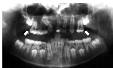
Figure 3: Taurodontism of permanent maxillary first molars.