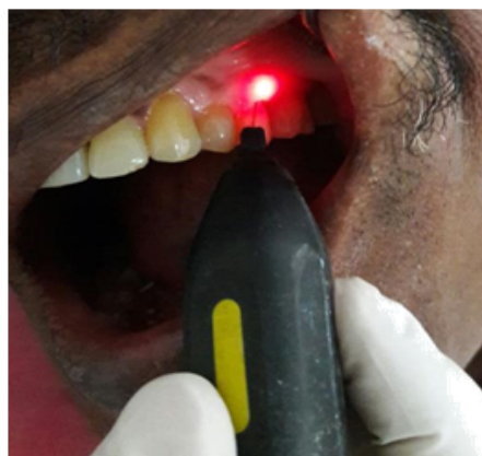
Figure 2: Diode laser debridement in non-contact mode.