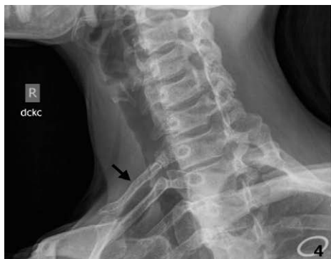
Figure 4: Radiographs showing left cervical rib before excision.