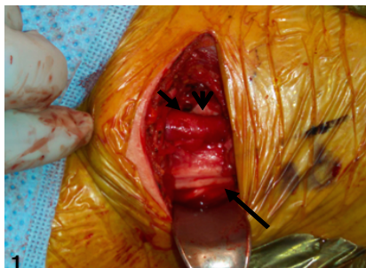
Figure 1: Left subclavian artery (short arrow) and brachial plexus (long arrow) exposed with cervical rib partially visible behind it (arrowhead).