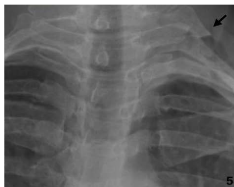
Figure 5: Radiographs showing left cervical rib after excision.

Intraoperatively, a large subclavian artery aneurysm was found just anterior to the cervical rib, and the cervical rib was fused to the first rib just underneath the subclavian artery. On inspection, the subclavian artery aneurysm appeared to result from post-stenotic dilatation stemming from compression by the cervical rib. Immediately proximal to the dilatation, a water hammer pulse was dopplered, with loss of pulse in the artery distal to the rib extending into the axillary artery.