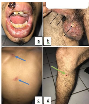
Figure 2: Extra ocular sign of Behcet's disease with atypical Granulomatous Uveitis in 37-year-old patient.

From a therapeutic point of view, all patients underwent full-dose corticosteroid therapy. An immunosuppressant type cyclophosphamide by bolus was introduced in 9 patients, with a relay initiated in 8 patients by azathioprine. One of these patients was in addition treated with biotherapy (anti-TNF) due to severe ocular involvement. The average duration of follow-up was three years. A good response was noted in 64.4% (Figure 2).