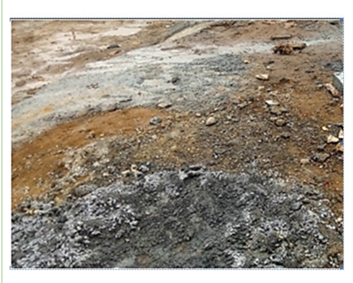
Figure 6B: Excavation of concrete remnants in the University.

Figure 6A: Excavation of earth on the site of the installation of the sewerage network in the University.