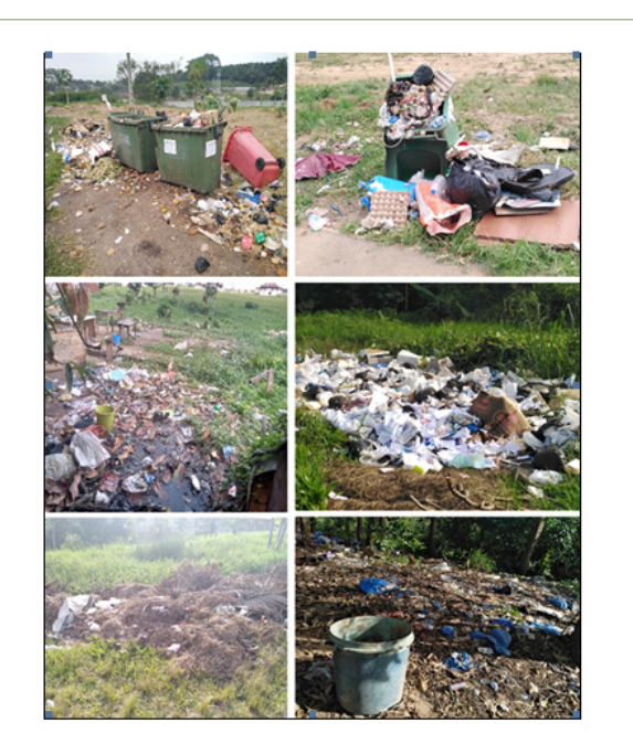
Figure 9: Illustration of the mismanagement of waste practiced at NANGUI ABROGOUA University.

This management method practiced at the UNA degrades the university environment and causes nuisance (i.e. release of foul odors, proliferation of mosquitoes and rodents, etc.). In addition, no sorting of waste is carried out either at the level of production sources or in the management circuit to separate the waste according to its nature. However, some waste such as plastic packaging and metal materials (empty cans) are collected by housekeepers to be reused or recycled. These waste management methods practiced are relatively similar to those observed in the university campuses of Hawassa, Ethiopia, in particular through the burning of certain waste and the fact that only limited solid waste is recycled [19].