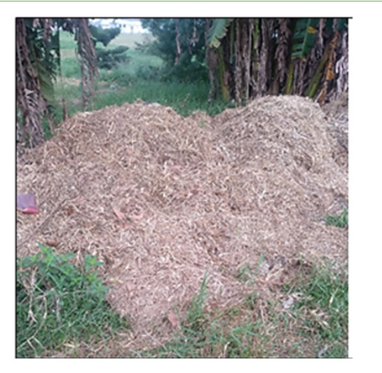
Figure 4A: Illustration of ordinary waste produced at NANGUI ABROGOUA University: Garden waste.

metal waste, etc. Because of their similarity to household waste, this waste enters the household waste management circuit of the district of Abidjan. No portion is sold compared to the practices in Hawassa University Campuses, Ethiopia [19], where a portion of leftover food was managed by selling to ranchers and giving it to poor-of-the poor. Figures 4A and 4B shows some ordinary waste encountered at the NANGUI ABROGOUA University.