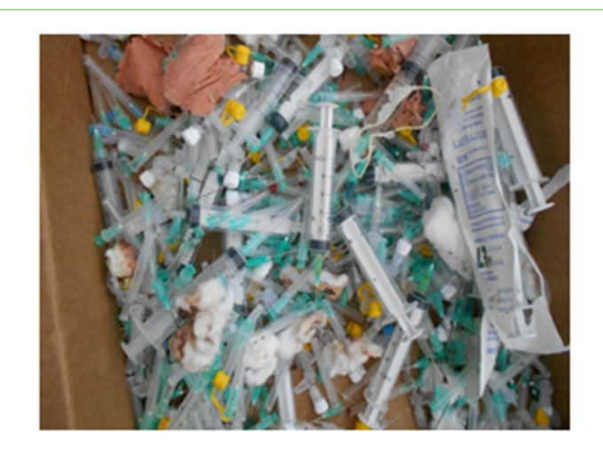
Figure 5A: Overview of infectious waste.

• Waste of electrical and electronic equipment (WEEE) or e-wastes such as computers, printers, photocopiers, analysis devices, microscopes, refrigerators, freezers and used air conditioners, empty ink cartridges, used printer toners, etc., (Figure 5B).