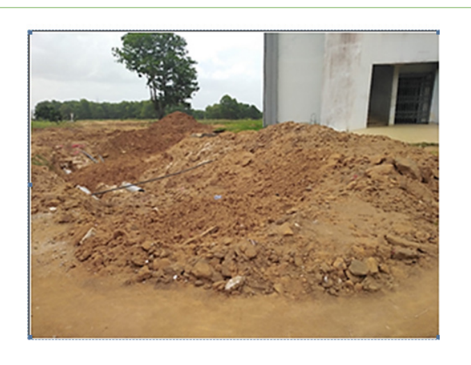
Figure 6A: Excavation of earth on the site of the installation of the sewerage network in the University.

buildings including restaurants, classrooms, amphitheaters, libraries, etc. These changes could be explained by the growing demand for infrastructure in the aforementioned educational institutions, to meet the exponential increase in staff [35,36].