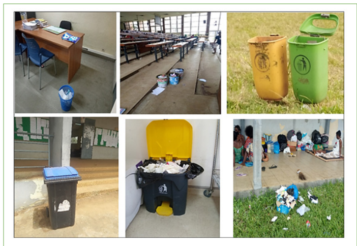
Figure 7: Conditioning of solid waste produced at NANGUI ABROGOUA University.

Solid waste generated within the NANGUI ABROGOUA University is conditioned in buckets and garbage bags inside the service and activity sites. Outside, the wards and in the university courtyard, bins and garbage bins are available to receive solid waste. Figure 7 shows the types of bins used for conditioning.