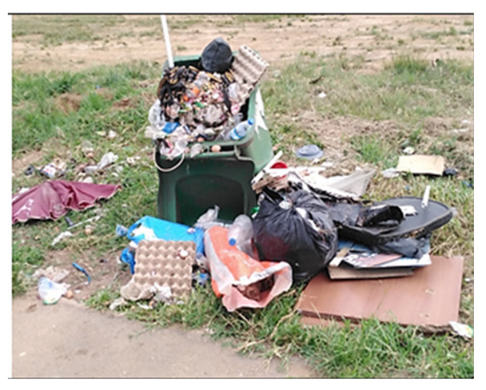
Figure 4B: Illustration of ordinary waste produced at NANGUI ABROGOUA University: Household waste.

Regarding to the special or hazardous waste, they result from the activities of research and laboratories, reprographics and the university health center. They include: