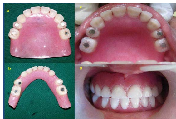
a. Maxillary denture with magnets embedded; b. Mandibular denture with magnets; c. Placement of maxillary denture; d. Depicting perfect occlusion

Hypodontia or anodontia is associated with lack of development of the alveolar ridges and results in less volume of bone for support of a conventional prosthesis. The prosthetic rehabilitation of a patient with ED involves conventional complete dentures (age appropriate) and implant supported complete dentures. Because of early age intervention and the need to frequently modify the intraoral prosthesis during rapid growth periods, a removable partial denture or complete denture prosthesis is indicated initially [7]. However, removable partial denture has certain complications like increased caries rate, periodontal complications, and increased residual alveolar resorption.