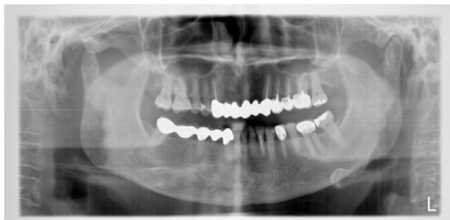
Figure 1: Panoramic radiograph showing right temporomandibular joint dislocation and no evidence of odontogenic pathology.

Bimanual reduction of the dislocated TMJ was failed in the ER setting, we thus performed intermaxillary fixation following closed reduction of right TMJ under general anesthesia. However, progressive right facial swelling was evident following closed reduction. Empirical antibiotics were administered.