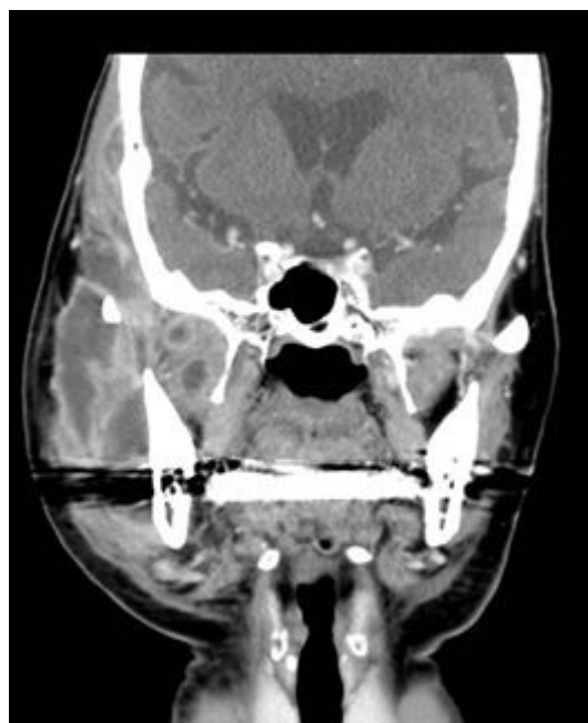
Figure 2(C): CT image after TMJ reduction: abscess spread extensively in the masticator and buccal space.