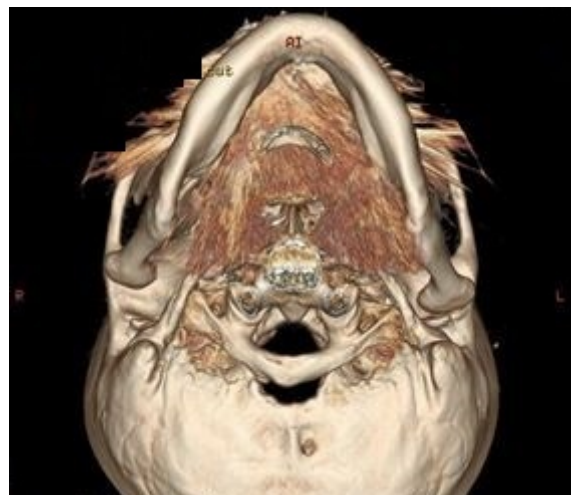
Figure 2(B): CT image before TMJ reduction with 3D reconstruction.

swelling subsided, and the patient's maximum mouth opening improved to 30+ mm.