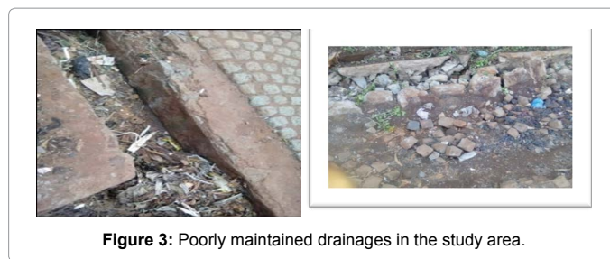
Figure 3: Poorly maintained drainages in the study area.

On the other hand, the provision of drainage system in the study area is characterized by absence city wide drainage network plan, shortage of capital and skilled manpower, lack of commitment on the side of contractors and micro and small scale enterprises. According to Armitage [9] in order to plan, implement, monitor and evaluate any activity, human resource has indispensable role in any sector. Ultimately,