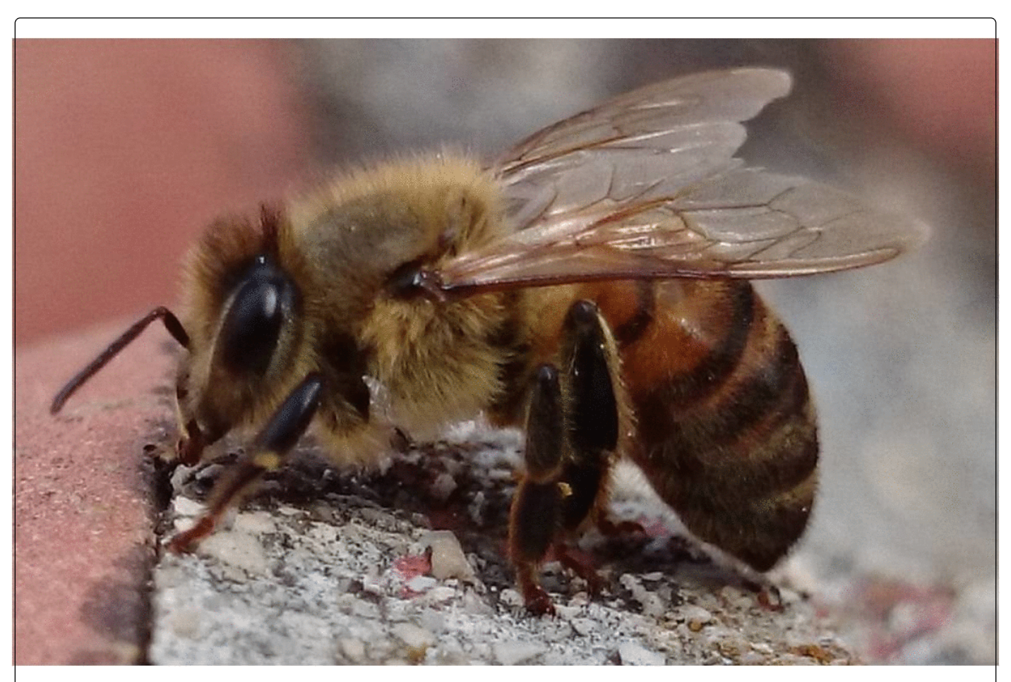
Figure 1: European Honeybee ( Apis mellifera Linneaus) is natural host of the small hive beetle ( Aethina tumida ). The European honeybee is particularly susceptible to the infestation suffering from heavy losses.