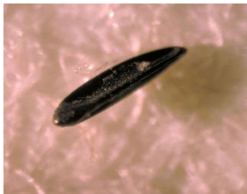
Figure 2: Egg of Aedes aegypti .

Regarding Aedes larvae , it can be distinguished from other genera by the unaided eye due to their short siphon which is used to breathe oxygen and it is held above the water surface while the rest of the body hangs vertically. Larvae feed on organic particulate matter in the water [26]. Males develop faster than females, so males generally pupate earlier. If temperatures are cool, Aedes aegypti can remain in the larval stage for months so long as the water supply is sufficient [27]. After Laval stage, Aedes aegypti enters the pupal stage. Mosquito pupae are different from many other holometabolous insects in that the pupae are mobile as shown in Figure 2. Pupae do not feed and approximately after 2 days the adults emerge head first by ingesting air to expand the abdomen thus breaking the pupal case [26].