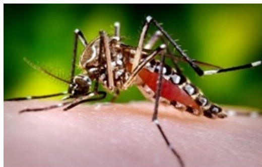
Figure 1: Female Adult Aedes aegypti

Adults Aedes aegypti has white scales on the dorsal surface of the thorax that form the shape of a violin or lyre as shown in Figure 1, while adult Aedes albopictus have a white stripe down the middle of the top of the thorax. The abdomen is generally dark brown to black, but also may possess white scales [12]. Females are larger than males, and can be distinguished by small palps tipped with silver or white scales. Males have plumose antennae, whereas females have sparse short hairs. When viewed under a microscope, male mouthparts are modified for nectar feeding while the female mouthparts are modified for blood feeding. The proboscis of both sexes and the tip of the abdomen come to a point, which is characteristic of all Aedes species [13,14].