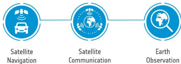
Figure 1: Value of space Technology.

surveying and countering the spread and also planning government legislations and policies that will help in preventing the spread as well as providing cure to the public (Figure 1).