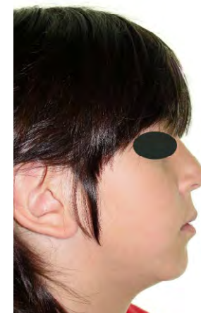
Figure 1b: Extraoral profile view.