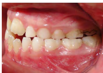
Figure 2c: Intraoral lateral left view.