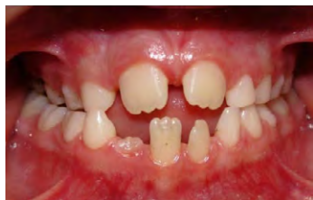
Figure 2b: Intraoral front view.