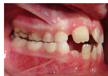
Figure 2a: Intraoral lateral right view.

indicated early mixed dentition, Class I molar relationship, an overjet of 1 mm, an openbite of -3 mm, unilateral posterior crossbite on the right side and a functional shift of the mandible due to premature contacts of the primary canines on both sides (Figures 2a-c). Oral hygiene was of a moderate standard, with staining mainly on the posterior dental surfaces. The pretreatment panoramic radiograph (Figure 3) revealed six permanent teeth missing—all four second premolars, upper left first premolar and upper right lateral incisor—indicating a case of hypodontia. The cephalometric analysis of the pretreatment lateral cephalometric radiograph (Figure 4), showed normal growth pattern, straight profile of the hard tissues, small cranial base length, retrognathic maxilla and prognathic mandible, with a slightly bigger mandibular body and the