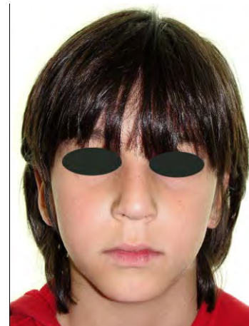
Figure 1a: Extraoral frontal view.

An eight year-old Caucasian male was presented by his parents to the Orthodontic Department of the Dental School of the Aristotle University of Thessaloniki, in Greece. The patient's chief complaint was “the gaps between his teeth”. According to his medical history, the boy was successfully treated in the age of seven months for Kawasaki disease and has not had any related or other general health problems since. No similar medical anamnestic data were reported in the family regarding Kawasaki disease and/or hypodontia. The facial extraoral examination revealed a straight profile type and a small asymmetry of the lower third of the face, because of a slight deviation of the chin to the left (Figures 1a and b). Intraoral examination and study models