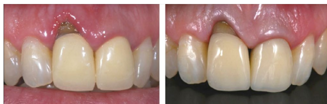
Figure 2: Gingival recession of the upper right central incisor one month after trauma from ultrasonic instrument (A) and after 3 months of healing (B).