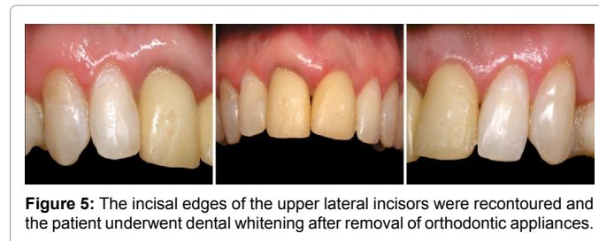
Figure 5: The incisal edges of the upper lateral incisors were recontoured and the patient underwent dental whitening after removal of orthodontic appliances.