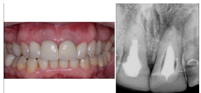
Figure 1: Initial presentation of the patient with a desire to improve esthetics of crowns on central incisors (A). Periapical radiographs of endodontically-treated maxillary central incisors (B).

A 45 year old male initially presented to a prosthodontist with the desire to improve the esthetics of his maxillary incisor crowns (Figure 1A). The upper central incisors had been previously endodontically treated. Initial periapical radiographs reveal failing endodontic treatment with periapical radiolucencies and adequate bone levels in both mesial and distal surfaces (Figure 1B). The patient was referred to an endodontist for retreatment. During post removal, the endodontist reported that the ultrasonic instrument slipped and hit the facial gingiva of the upper right central incisor. This resulted in necrosis of the facial gingiva and apical migration of the gingival margin beyond the mucogingival junction, without interdental bone loss, classified as a Class II Miller GR (Figure 2A) [12]. The endodontist suggested that the patient wait two months as he expected some spontaneous improvement. After this period, no improvement occurred and the