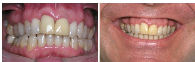
Figure 3: 2.5 mm relapse of the gingival graft of the upper right central incisor one month after gingival surgery (A), resulting in unfavorable smile esthetics (B).

patient had a 4.5mm gingival margin discrepancy between the two central incisors (Figure 2B).