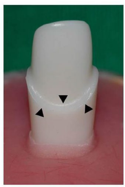
Figure 1: A prepared maxiliary lett central incisor model. The root portion of this model was embedded in acrylic polymer. Note the uniform margin with 1.0-mm shoulder (black arrowheads).