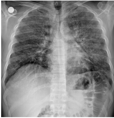
Figure 2: Chest radiography of the patient at admission.