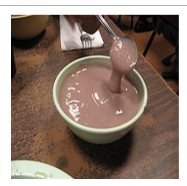
Figure 1: Hawaiian poi (from the Internet).

In some cantons in Switzerland, foreigners applying for citizenship are subjected to the test of fondue. Those who can not cook good fondue (Figure 3), are considered unfit to become Swiss citizens. Comte cheese, Emmenthal cheese and Gruyere cheese slices are made into a cream in a vessel with white wine. Then the mixture is cooked over a light flame and cherry liquor (Kirsch) is added. The food is eaten with long forks and by dipping dry bread pieces inside the bowl (Milliyet Newspaper-Foreign News Section, October 24, 2000) [5].