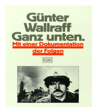
Figure 6: The book where it says that some pejudiced German foremen (Meisters) call guest Turkish workers merely "shish kebab eaters" (From the Internet).

and grilling is present. Meat is either boiled or else dried over soot; which may be related to the longevity of life spans of those folks [10].