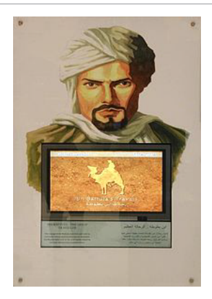
Figure 10: A representative picture of 14<sup>th</sup> century traveler Ibn Battuta, who mentions in his written work that Crimean Turks were ashamed to eat sweeties (from the Internet).

of the best actions a person can ever achieve in his life. Cooking itself is a unique field of action especially for women, whereby they can repair and rebuild themselves and make all their hatred, bitterness and happiness come into a sort of expression by deeds rather than words! [14].