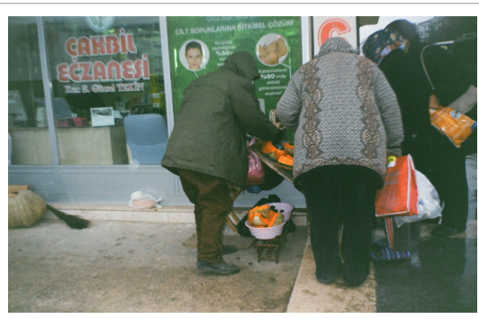
Figure 8: An elderly peasant man peddling his village's produce, sweet yellow gourd (winter squash), to city-women in front of a pharmacy, in the Turkish city of Edirne. (The mere attire of the peddler reveals his peasant origins: Riding trousers (culotte de cheval)with buttoned legs made of very thick felt-cloth. A commonplace sight about half a century ago, those pants now constitute an extremely rare sight).