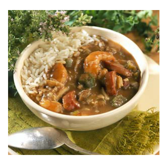
Figure 5: Gumpo of New Orleans (from the Internet).