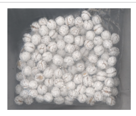
Figure 9: Sugar-coated chick peas, a Turkish candy for children.