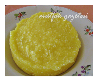
Figure 2: Hoşmerim Turkish dessert.

<sup>3</sup>A soup made with potatoes, leeks, and cream and typically served chilled. <sup>4</sup>A culinary name for the thymus (also called throat, gullet). The Turkish equivalent is called "uykuluk" and is a famous dish in Sütlüce district of İstanbul.