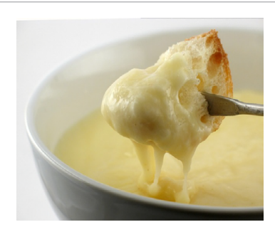
Figure 3: French fondue (From the Internet).

<sup>3</sup>A soup made with potatoes, leeks, and cream and typically served chilled. <sup>4</sup>A culinary name for the thymus (also called throat, gullet). The Turkish equivalent is called "uykuluk" and is a famous dish in Sütlüce district of İstanbul.