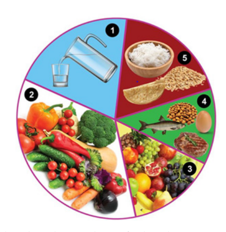
Figure 1: Flow chart showing dietary food intake.

Eat a balanced diet always; never eat to full stomach, high fiber vegetables should form the major portion of the food (Figure 1) [1]. High fiber vegetables are not a side dish, but make it a main dish. Take fruits daily, vegetables and fruits should be there each time, fill only half the capacity of stomach, never go for a refill when we eat-maximum three times a day only (Figure 2) [2].