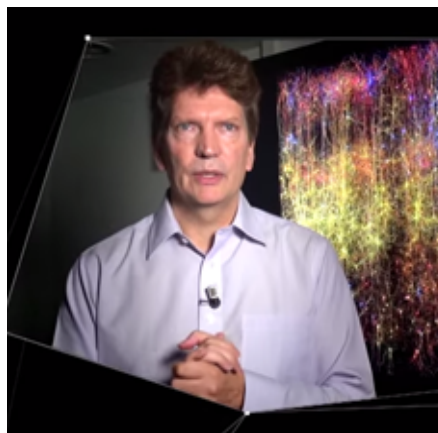
Figure 1: Henry Markram.

Normal and Virtual Brains differentiation is explained in Figure 4.