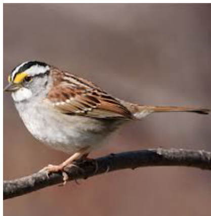
Figure 3: Bird.